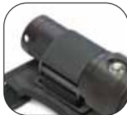
Tighten by pulling the Velcro