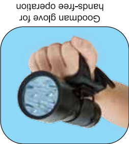
Goodman glove for hands-free operation