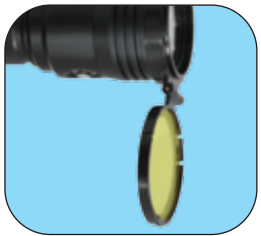
Removable yellow filter