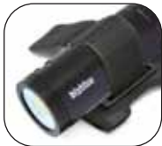
Put the Velcro through the slot of the plate and through the loop