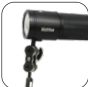
*Photographic Arms and Clips are sold separately