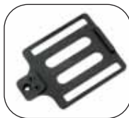
Aluminum Adapter plate