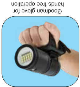
Goodman glove for hands-free operation