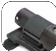
Tighten by pulling the Velcro