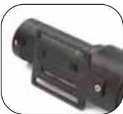
Fix the plate with the supplied screw