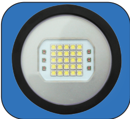
25pcs XML LED to provide 15000 lumens