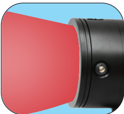
Built-in red color led enhances focusing performance