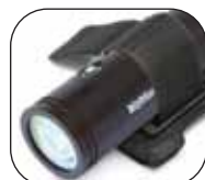
Put the Velcro through the slot of the plate and through the loop