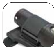
Tighten by pulling the Velcro