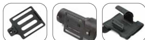
Aluminum Adapter plate