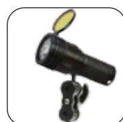
*Photographic Arms and Clips are sold separately