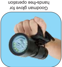
Goodman glove for hands-free operation